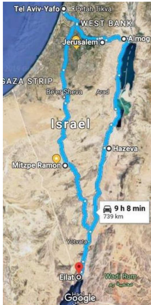
Figure 3 GIUB 2019 trip to Israel and Palestine itinerary

Recalling the ICJ Advisory Opinion of July 2024 57 and the UNGA A/ES-10/L.31/Rev.1 58 cited in Section 1, we conclude that the University of Bonn, by maintaining exchange partnerships with HUJ and research trips that rely on the use of illegally annexed land, is helping give recognition to, and assistance in maintaining, the annexation of East Jerusalem and the West Bank by the Israeli Government and Israeli settlers. This could constitute a breach of International Law regarding the Apartheid rule on Palestine and the privation of the internationally acknowledged right to self-determination of Palestinians.